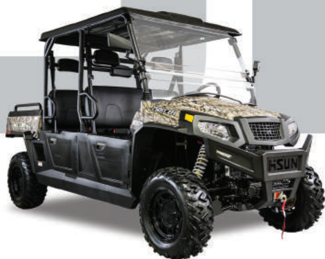
SECTOR 750 CREW