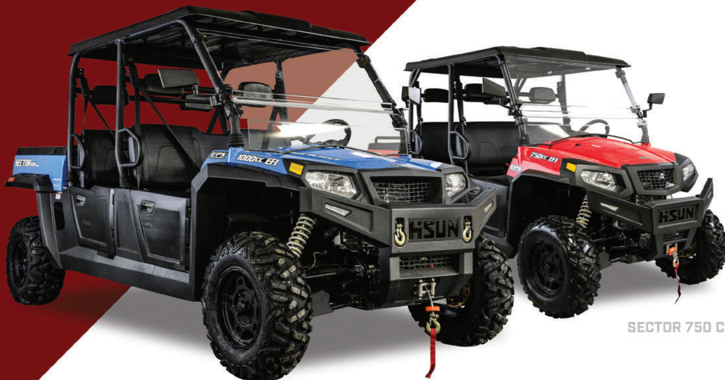
SECTOR 1000 CREW