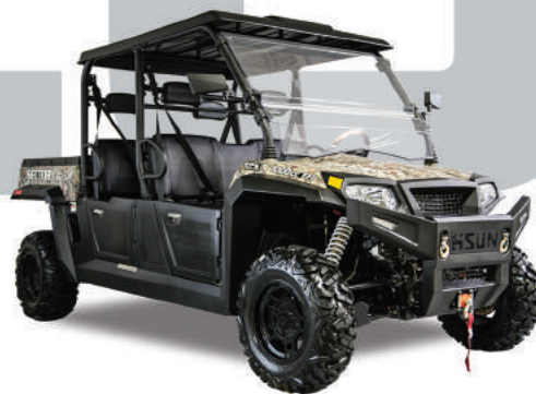
SECTOR 1000 CREW