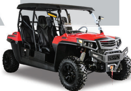
STRIKE 1000 CREW