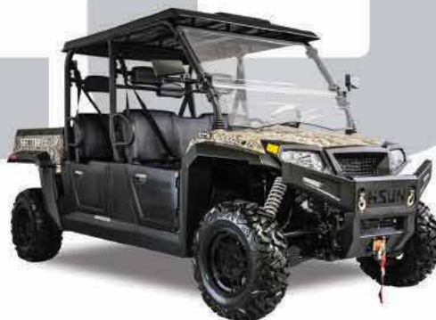
SECTOR 1000 CREW