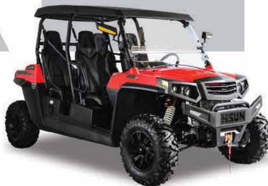
STRIKE 1000 CREW