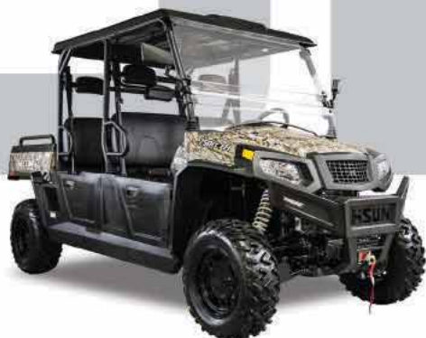
SECTOR 750 CREW