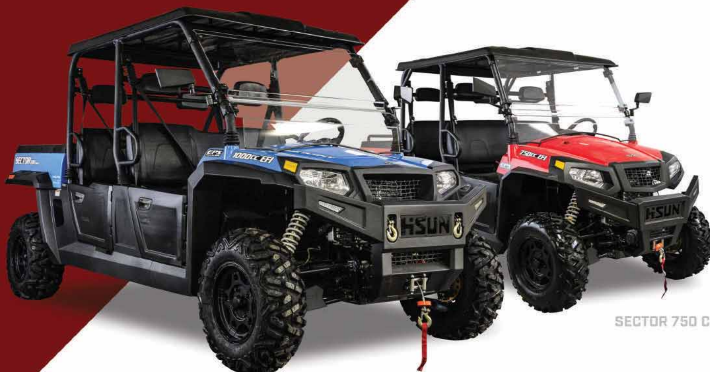
SECTOR 1000 CREW